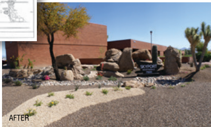
The photos and blueprints above demonstrate the drastic transition that can be achieved with a landscape upgrade.

"Often landscaping is the first impression of a property"